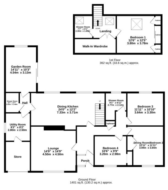
TOTAL FLOOR AREA: 1763 sq.ft. (163.8 sq.m.) approx. Measurements are approximate. Not to scale. Illustrative purposes only